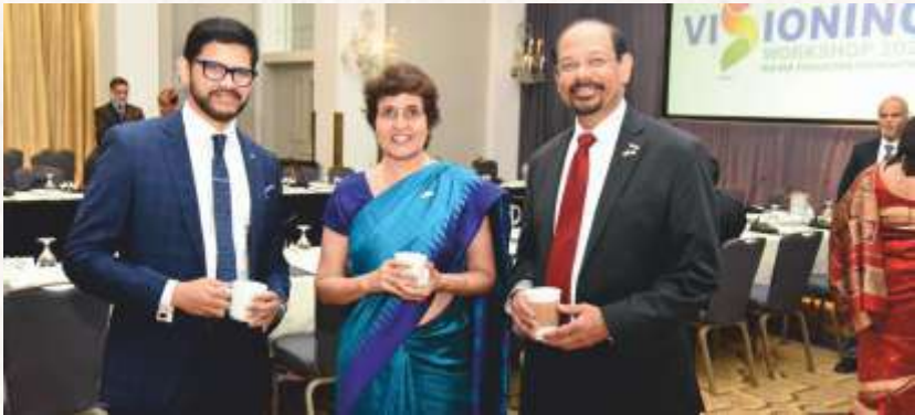
The distinguished members of the Visioning Workshop Working Committee