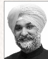
Taranjit Singh Sandhu Ambassador, Embassy of India in Washington D.C.