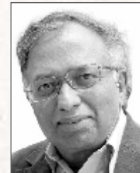
Vijay Bhatkar Padmavibhushan, Ex-Chancellor, Nalanda University