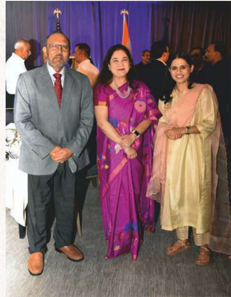
Illustrious members of the Visioning Workshop at Hotel Mayflower, Washington D.C., USA