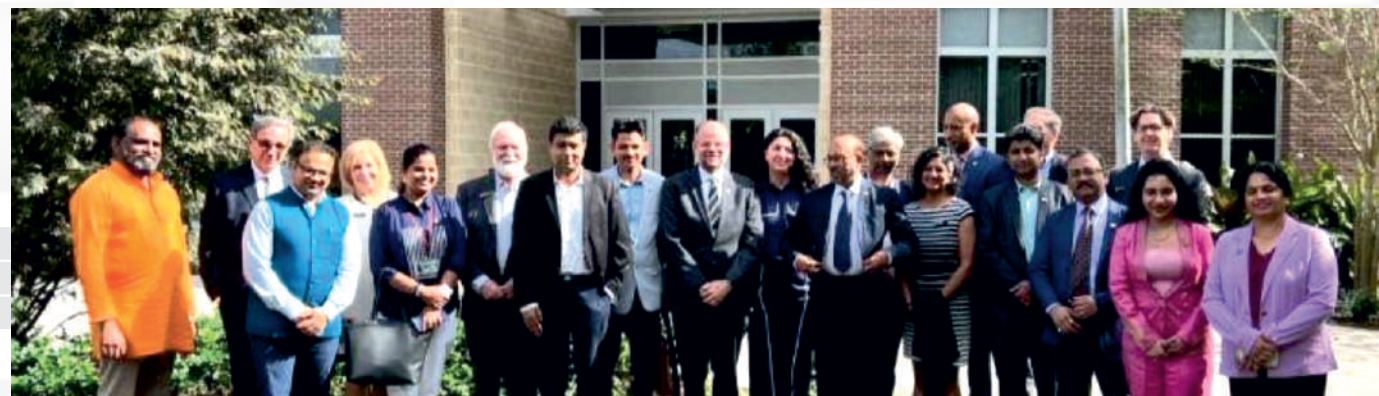
Visit to the University of Central Florida