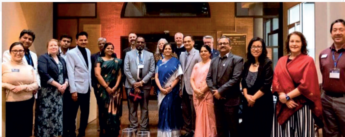
Visit to the University of Arizona