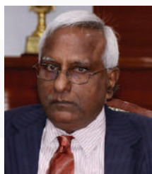
Grc Reddy S.R. University Telangana