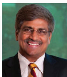
Sethuraman Panchanathan Director, U.S. National Science Foundation (NSF)