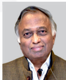
Padma Bhushan Dr. Vijay Bhatkar Former Chancellor, Nalanda University, Eminent Computer Scientist