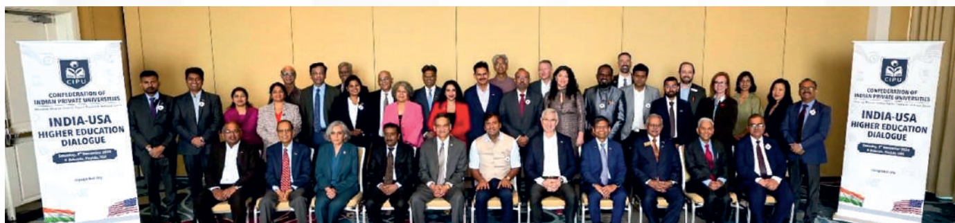
Indian Academic Leaders' Delegation

A Confederation of Indian Private Universities (CIPU) initiative aimed at strengthening ties in the higher education sector. The event focused on enhancing academic exchange, promoting research partnerships, and fostering mutual understanding between institutions in India and the USA. The dialogue was held to provide a platform for leaders, policymakers, and educators from both countries to discuss opportunities for cooperation, address challenges, and share best practices in higher education. It included discussions on student mobility, academic collaborations, faculty exchanges, and joint research initiatives. Overall, the dialogue sought to strengthen the educational and cultural ties between India and the United States, benefiting both students and universities.