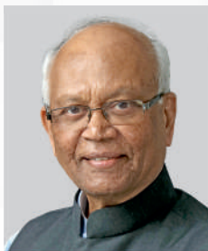
Padma Vibhushan Dr. R. A. Mashelkar National Research Professor, Eminent Scientist

Founder & Chief Patron, CIPU & Executive President, MIT World Peace University, Pune