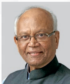
Padma Vibhushan Dr. R. A. Mashelkar National Research Professor, Eminent Scientist

Chief Patron, CIPU & Executive President, MIT World Peace University, Pune