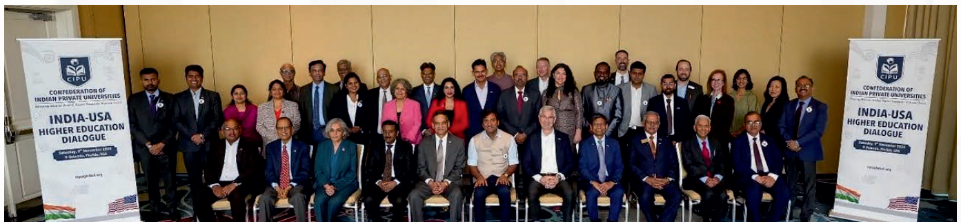
Indian Academic Leaders' Delegation

A Confederation of Indian Private Universities (CIPU) initiative aimed at strengthening ties in the higher education sector. The event focused on enhancing academic exchange, promoting research partnerships, and fostering mutual understanding between institutions in India and the USA. The dialogue was held to provide a platform for leaders, policymakers, and educators from both countries to discuss opportunities for cooperation, address challenges, and share best practices in higher education. It included discussions on student mobility, academic collaborations, faculty exchanges, and joint research initiatives. Overall, the dialogue sought to strengthen the educational and cultural ties between India and the United States, benefiting both students and universities.