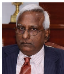
Grc Reddy S.R. University Telangana