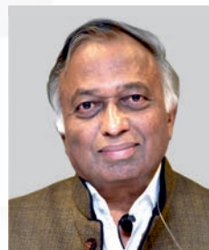
Padma Bhushan Dr. Vijay Bhatkar Former Chancellor, Nalanda University, Eminent Computer Scientist