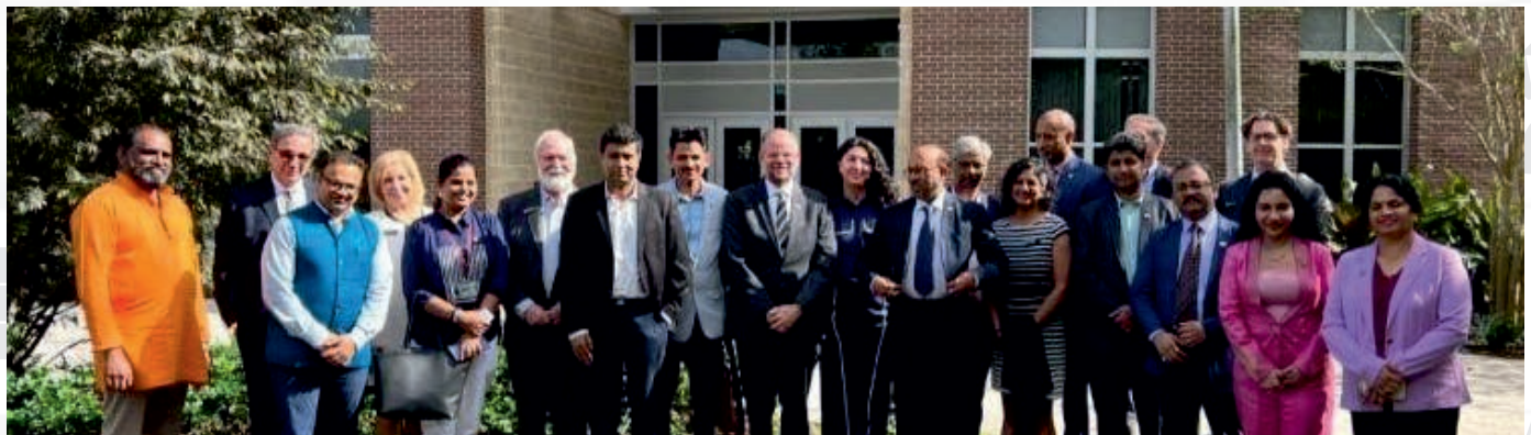
Visit to the University of Central Florida