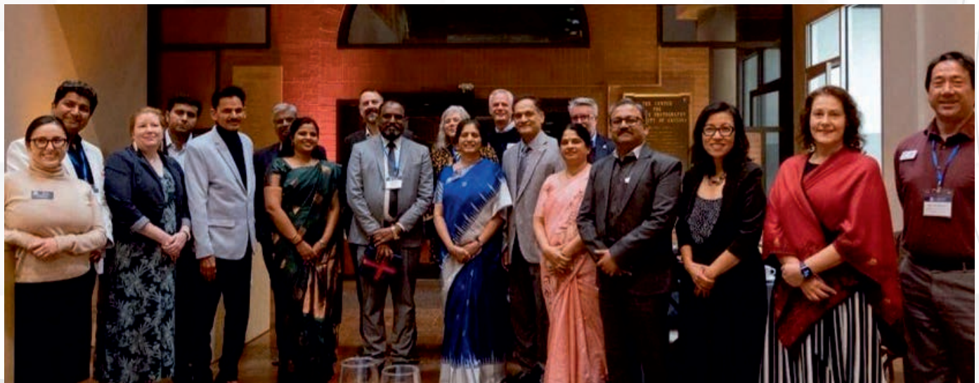
Visit to the University of Arizona