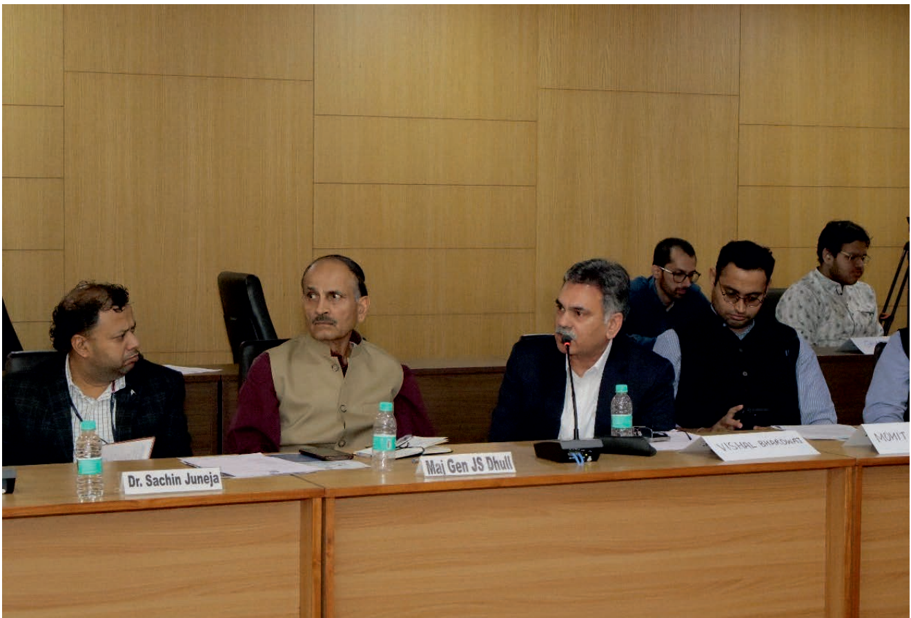
An engaging discussion in progress by CSR Head and Academia Delegate