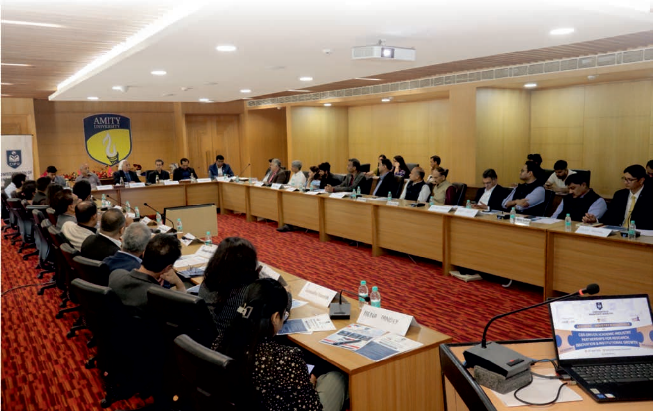
The Academic – Industry National Roundtable Conference successfully organized by CIPU and hosted at Amity University